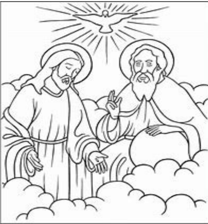
Holy Trinity