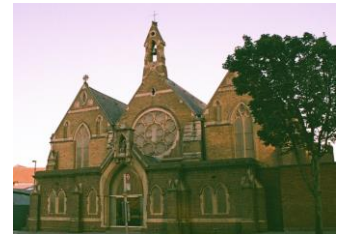
(St. Mary's, Croydon) Our Lady of Reparation

Good Friday 29 th March to Saturday 6 th April