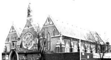
Our Lady of Reparation, Croydon (St. Mary's RC Church)