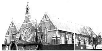
Our Lady of Reparation