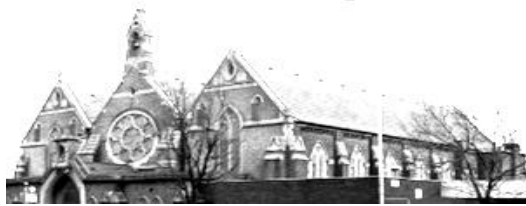
Our Lady of Reparation