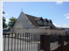
WEST CROYDON METHODIST CHURCH