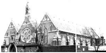
Our Lady of Reparation St. Mary's RC Church West Croydon